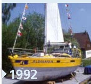
Launch in Germany's Black Forest in May 1992

Operation as a "swimming broadcasting vessel" for Deutschlandfunk as part of a media regatta including an own on-board radio program with prominent moderators