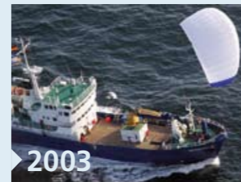
Public relations for SkySails