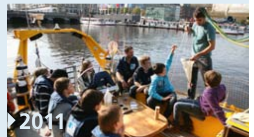
▶ 2011 ALDEBARAN at the Climate Week in downtown Hamburg