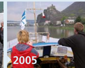
"ElbKultour": Radio and TV live from Prague to Hamburg