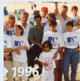
ALDEBARAN team at the ZDF "Coast Report"

The first underwater webcam in a national park is installed at Egypt's Peninsula of Sinai and broadcasts images for half a year