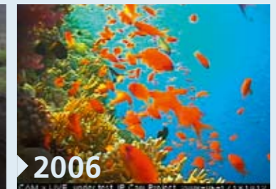
First underwater webcam in the Red Sea