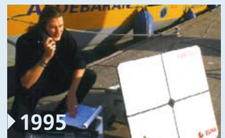
Live broadcast via satellite