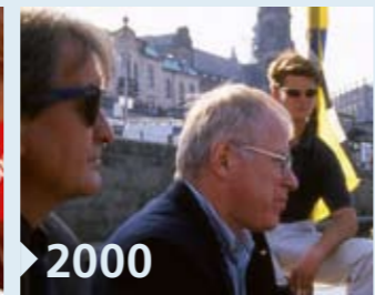
Press Conference for Deutschlandradio on German Reunification Day