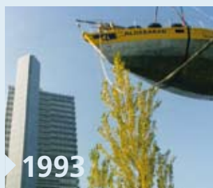
The ALDEBARAN in front of the legendary "Langer Eugen" building in Bonn