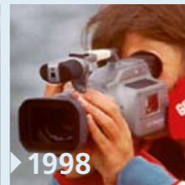
Recording, transmitting and broadcasting from aboard