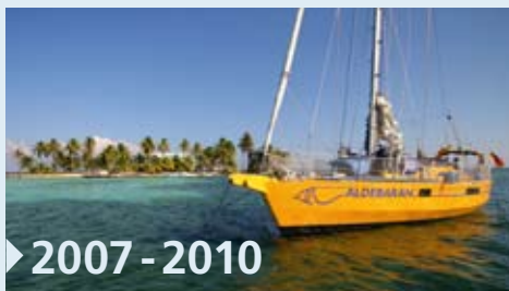
▶ 2007 - 2010 Three climate expeditions to the Belize Barrier Reef